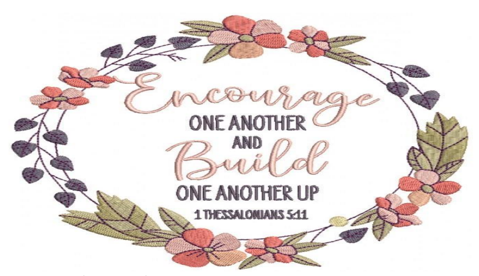
Mothers' Union—Midday Prayers—October 2022 Transformed Lives