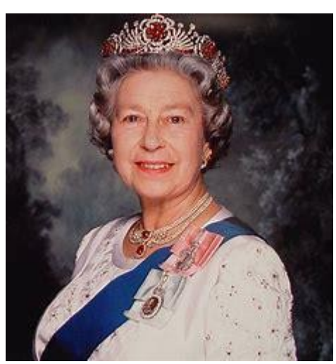
Her Majesty Queen Elizabeth II 21 April 1926 – 8 September 2022